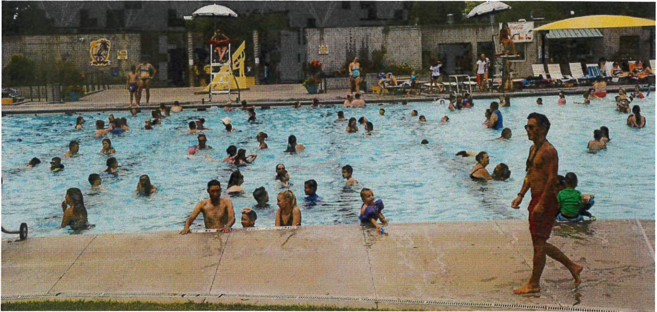
Papio Bay Aquatic Center, located at 815 E. Halleck St.